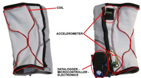
Figure 2: Knee brace designed by TNO Medical Devices; placement of accelerometers, coil, data logger, microcontroller and electronics to feed the LC-circuit.

their locomotion in three different levels, namely, jogging, running and sprinting. The recorded knee angles are labelled by video observation during the track traverse.